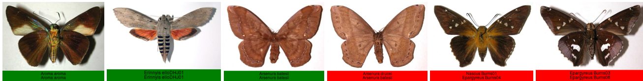
Figure 1: Example classification results for the Costa Rica dataset (input image, predicted label, ground-truth label). Images are directly obtained from [5] and have the following identifiers: 00-SRNP-1311-DHJ33001, 00-SRNP-1536-DHJ95316, 00-SRNP-4253-DHJ36384, 00-SRNP-4253-DHJ36385, 01-SRNP-16434-DHJ305668, 03-SRNP-20073-DHJ91439.

substantially contribute to species-sorting by untrained persons, or to monitoring schemes in endangered habitats. The images have been taken in a controlled environment with uniform background and canonical poses, which makes it easy to focus feature extraction on the important parts of the image. Since the dataset only includes a few images per species, we use male and female individuals within one category. We will release a challenging subset of the dataset to the public.