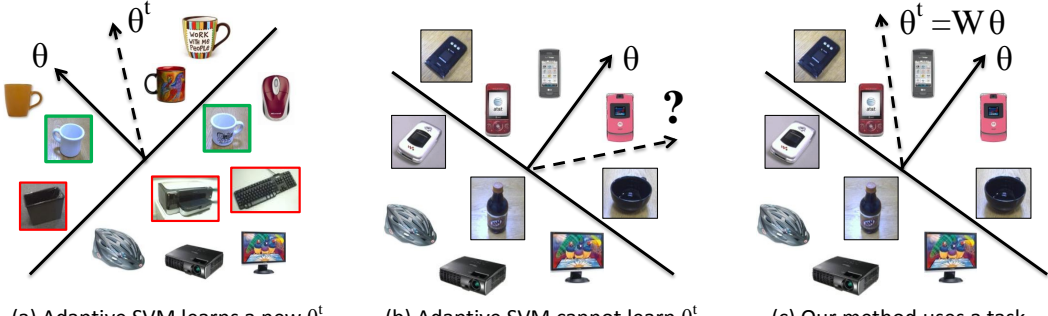
(a) Adaptive SVM learns a new \theta^t using target labels for cup